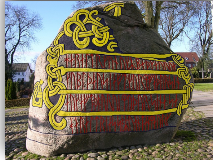
The great Jelling stone, painted electronically.

Jelling's archaeological artifacts are considered a UNESCO World Heritage Site, and include two 10th century rune stones and two burial mounds, as well as a new exhibition centre.